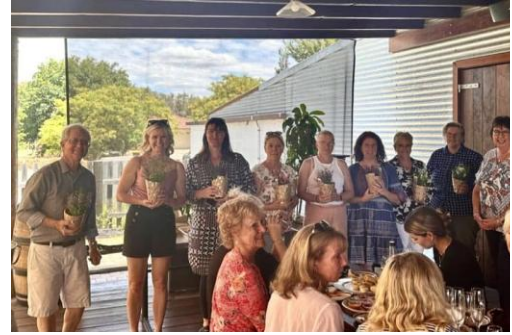
The 2022 team

We are short of help with our sponsorship sub-committee this year so if anyone can spare us some time to help liaise and source sponsors please flick us an email or text. OR if you can support our club through your business by sponsoring classes or a leaderboard rug we would love to hear from you! Please email swanriverdressageevents@gmail.com and we will contact you to have a chat about what we can do for your business.